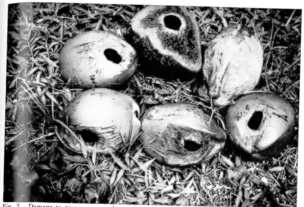
Fig. 2. Damage to green coconuts by roof rats. The center nut in the upper row was opened and used for a drinking nut and is showed for comparison (Majuro)