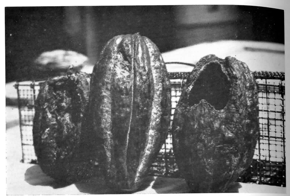
Fig. 3. Damage to cacao pods by roof and Polynesian rats (Ponape)