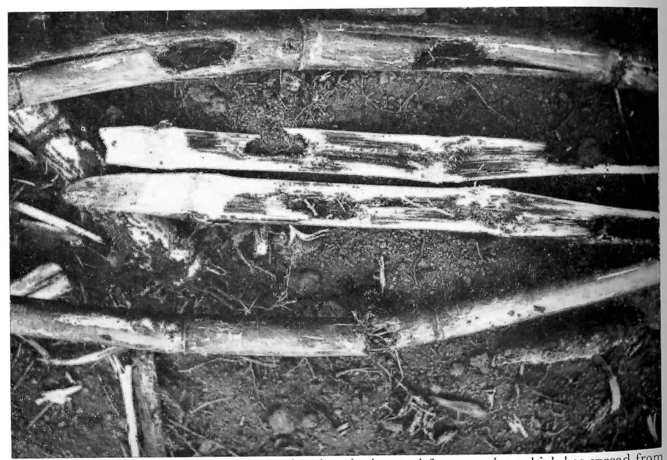
Fig. 4. Damage to sugar cane by rats, showing the internal fermentation which has spread from the site of feeding (Hawaii)