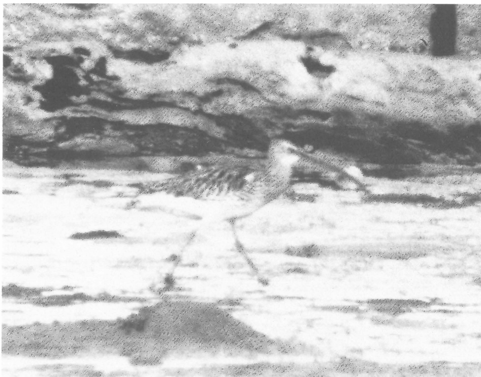
Figure 6. Eurasian Curlew on Saipan, 5 Dec. 1989.

On 2 Sept. 1990, D. A. Scott sighted two Great Knots on mudflats near the Puerto Rico Dump, Saipan, the first for the Marianas. One individual was observed by DWS and Scott at 40 m with a 40 \times spotting scope on 3 September. This very large calidrid had a long, stout black bill and dark gray legs. The streaked head and neck, boldly spotted breast, and lack of clear supercilium distinguished this bird from the similar sized Red Knot ( Calidris canutus ). The belly was clear white. The spotting and lack of brownish-buff on the breast is typical for non-breeding adults (Hayman et al. 1986). There are records of this species from Palau and Chuuk (Pratt et al. 1987).