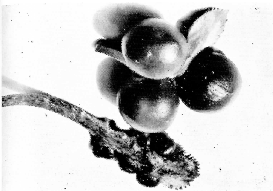
Fig. 1. Cycas circinalis (seeds).

Cycas circinalis , Federico palm or Cycas (Chamorro: Fadan, fadang). Fam. Cycadaceae.