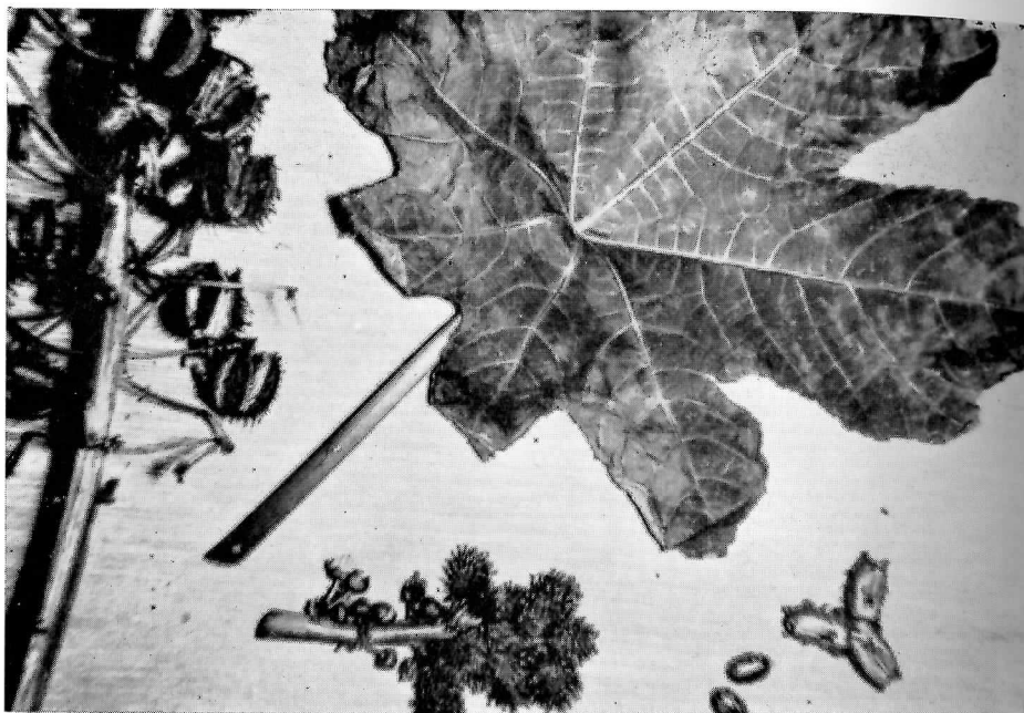
Fig. 2. Ricinus communis .

Ricinus communis , Castor Bean (Chamorro: Agaliya). Fam. Euphorbiaceae.