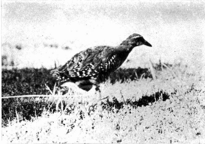
Fig. 2-A. Guam Rail ( Rallus owstoni ).