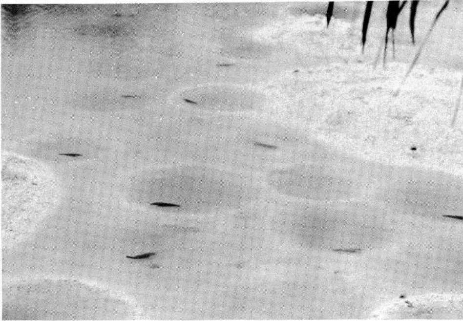
Fig. 2. Tilapia in nests at Napu Naiaroa estuary.

crowded into the shallow sections of the estuary, shaded by low, overhanging palm fronds and other vegetation. Tilapia stranded in shallow areas beyond this cover area were exposed to piscivorous birds that we observed frequently swooping to catch these fishes. Jacks and sharks were observed attacking tilapia aggregations, often splashing as they invaded the shallows.