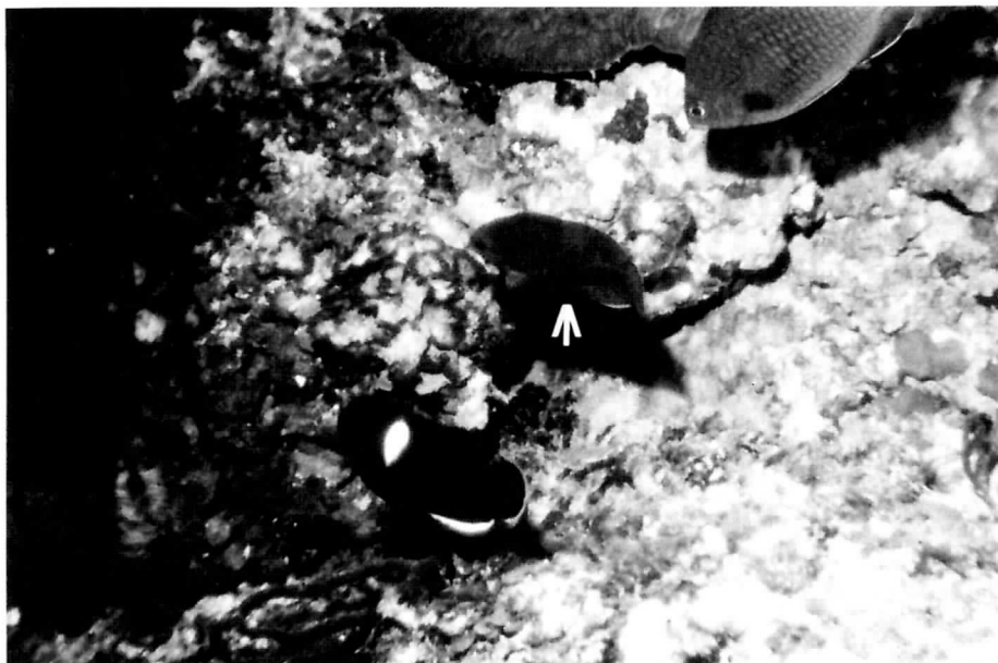
Fig. 2. Females of Centropyge tibicen and C. bispinosus (arrow), members of the same harem at Miyake-jima, Japan, where C. bispinosus is rare.

during my study of the latter species at Miyake-jima in 1978–1979 (Fig. 2). No attempts were made to observe spawning at this harem. Similarly, P. Colin (pers. comm.) reported a single C. bicolor in a harem of C. heraldi at Enewetak.