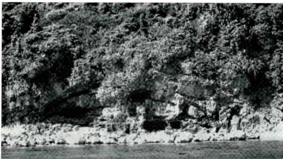
Fig. 2. Sea cave at Ypao Point. The shore bench cut in Mariana Limestone is exposed at low tides. The drape effect over the cave is also developed in Mariana Limestone. Horizontally stratified beachrock of sand and coral conglomerate fills the cave. The cave is 50 m wide and 8 m high and its floor is 2.6 m above the shore bench.

The second cave is 50 m east of the large cave. It is about 10 m wide and its