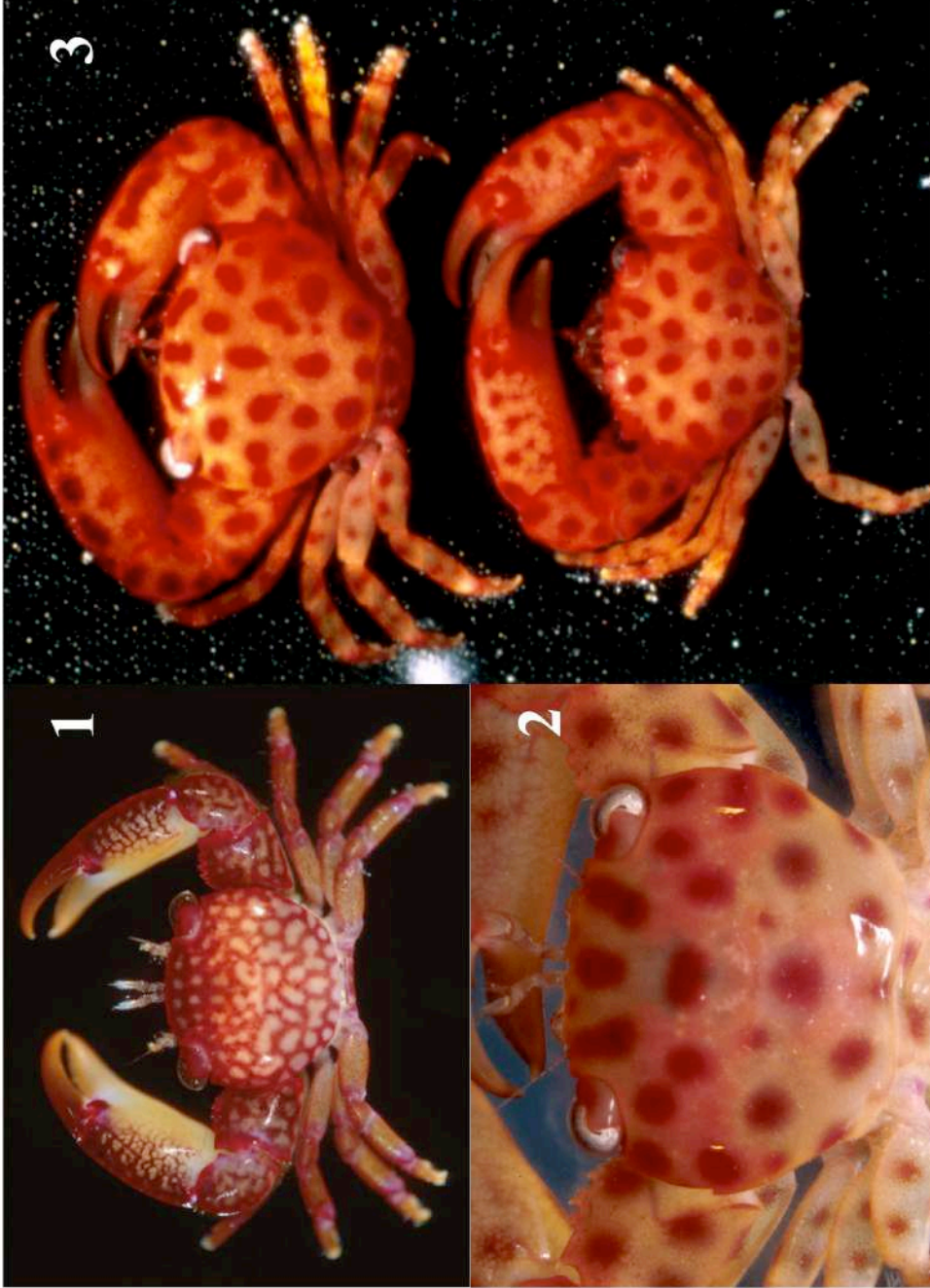
Figures 1-3. 1. Trapezia garthi Galil, 1983. Male, Kenting Islands, Taiwan; 2. Trapezia neglecta n.sp. Holotype, female (cl 6.7 mm, cw 8.5 mm; SMF 26290), on Pocillopora sp., Janum Bay, Guam: dorsal surface of carapace.; 3. Trapezia neglecta n. sp. Male and female, on Pocillopora verrucosa . Guam.