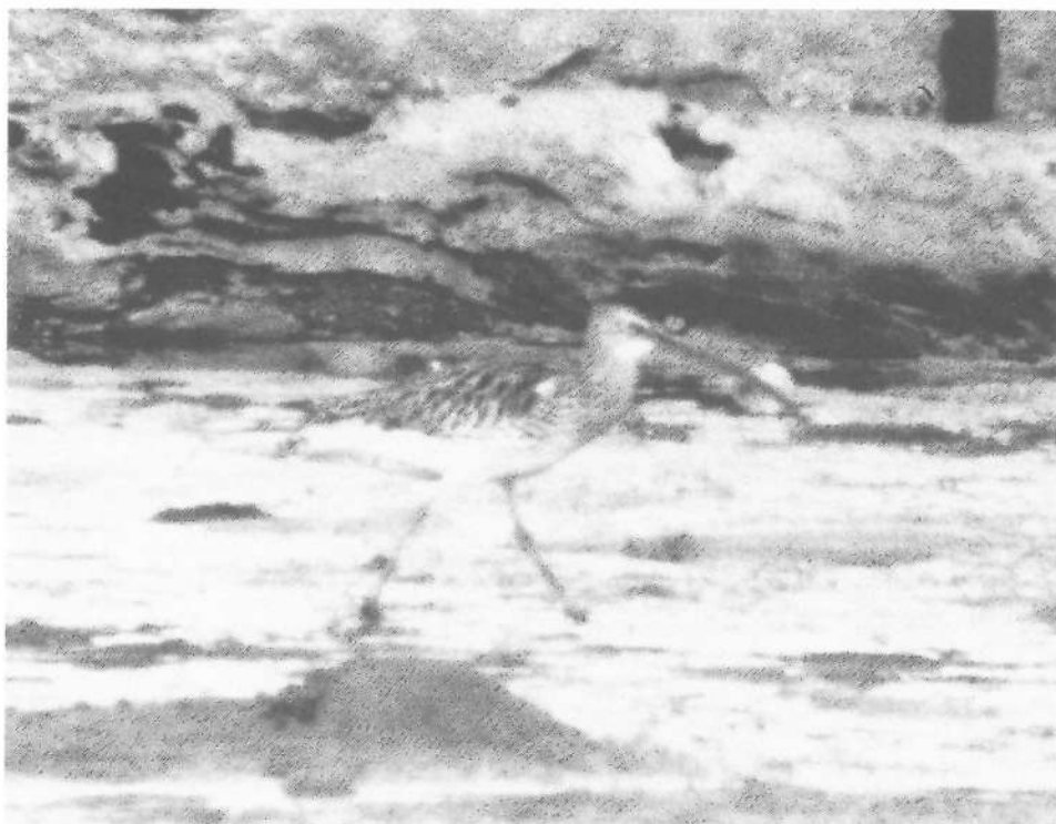
Figure 6. Eurasian Curlew on Saipan, 5 Dec. 1989.