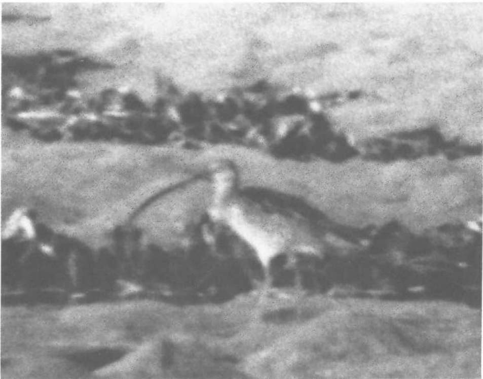
Figure 5. Far Eastern Curlew on Saipan, 9 May 1989.

This species was present on Saipan 4–6 December 1989 and DWS photographed it on 5 December (Fig. 6). This bird was readily identified by its large size, extremely long bill, lack of a crown stripe, indistinct supercilium, white lower back, rump, and wing linings. Other Mariana reports for this species include two sight records for Saipan and a recent one on Guam (Wiles et al., in prep., Engbring & Owen 1981, DFW files).