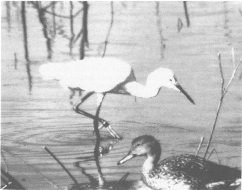
Figure 2. Little Egret on Saipan, 8 Dec. 1989.

On 30 Nov. 1989, JDR and DWS saw a single male in near eclipse plumage on Lake Susupe, Saipan. With the aid of a 35× spotting scope, we noted the rust colored head, somewhat sloped bill and forehead (not as much as A. valisineria ) and slightly peaked crown. The blue bill was dark at its base and tip. The back