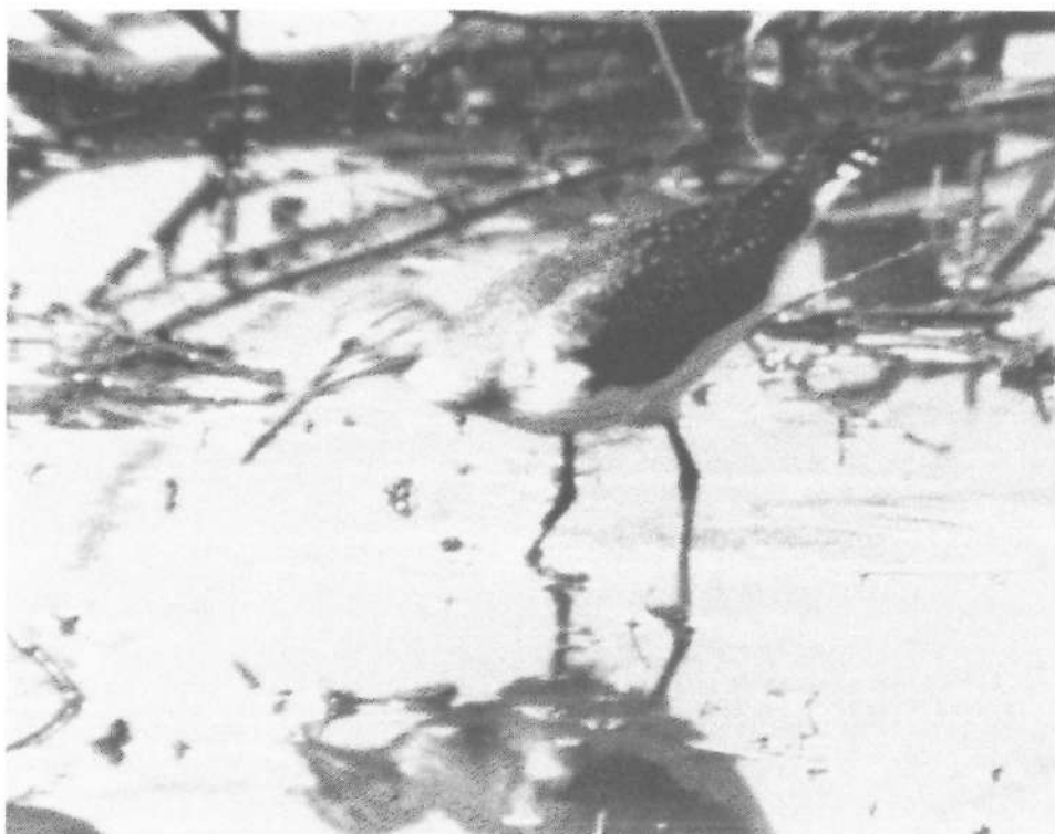
Figure 4. Green Sandpiper on Saipan, 8 Dec. 1989.