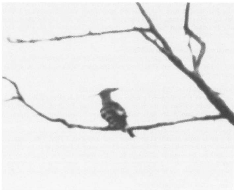
Figure 7. Hoopoe on Saipan, Aug. 1988.

of this African and Eurasian species is in southeast Asia; it has been recorded as a straggler in Japan (Wild Bird Society of Japan 1982).