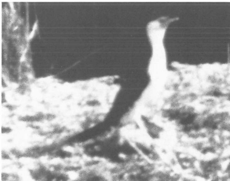
Figure 1. Little Pied Cormorant on Saipan, 6 Dec. 1989.

DWS and JDR made the first sight record of this species on Pagan at Lake Lagona on 26 Apr. 1989. JDR viewed the head and body closely; the bill was black and the lores appeared to blend from black to light gray-green just forward of the eye. It had a more gradually rising forehead and snakelike neck than a Cattle Egret ( Bubulcus ibis ). DWS saw the black legs and yellow feet.