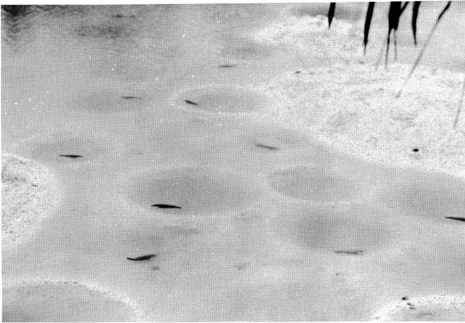
Fig. 2. Tilapia in nests at Napu Naiaroa estuary.

crowded into the shallow sections of the estuary, shaded by low, overhanging palm fronds and other vegetation. Tilapia stranded in shallow areas beyond this cover area were exposed to piscivorous birds that we observed frequently swooping to catch these fishes. Jacks and sharks were observed attacking tilapia aggregations, often splashing as they invaded the shallows.