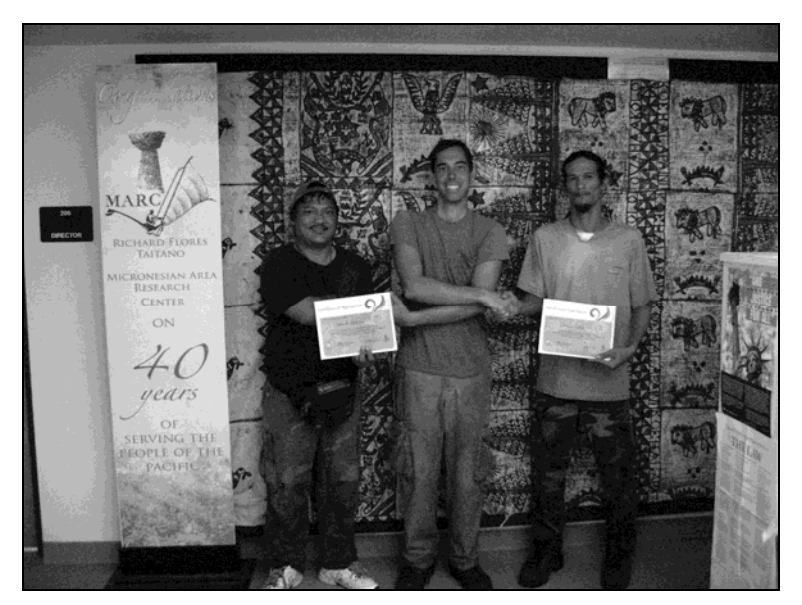
Figure 6. Historic Preservation Office technical staff training, representatives from Saipan receiving certificates of completion of special training session in Guam, 2008.