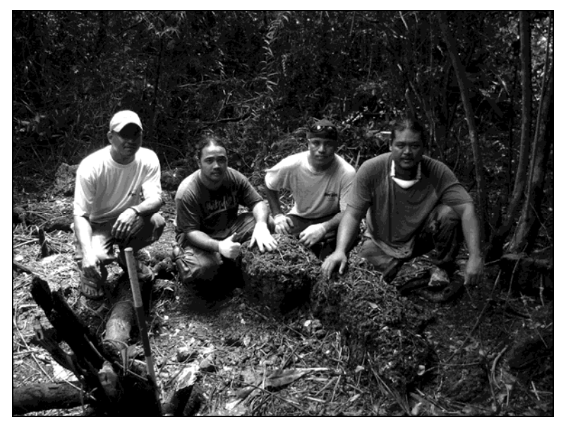
Figure 5. Historic Preservation Office technical staff training, representatives from Pohnpei, Saipan, and Chuuk documenting a disturbed latte set in Guam, 2008.