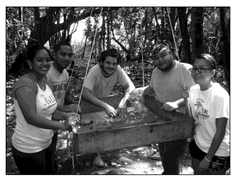
Figure 2. University of Guam archaeology field school students, practicing skills of screening for artifacts in excavated sediment at Ritidian, 2010.