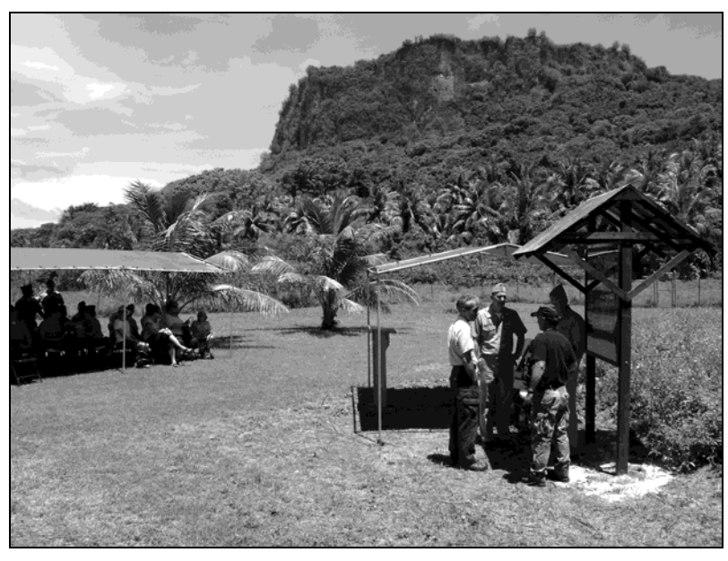
Figure 7. Public participation in archaeology, opening of new interpretive trail system at Ritidian, 2011.