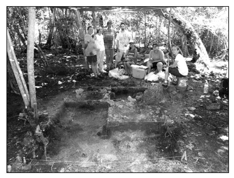
Figure 3. University of Hawaii archaeology field school students, reviewing notes and records of excavation at Ritidian, 2009.