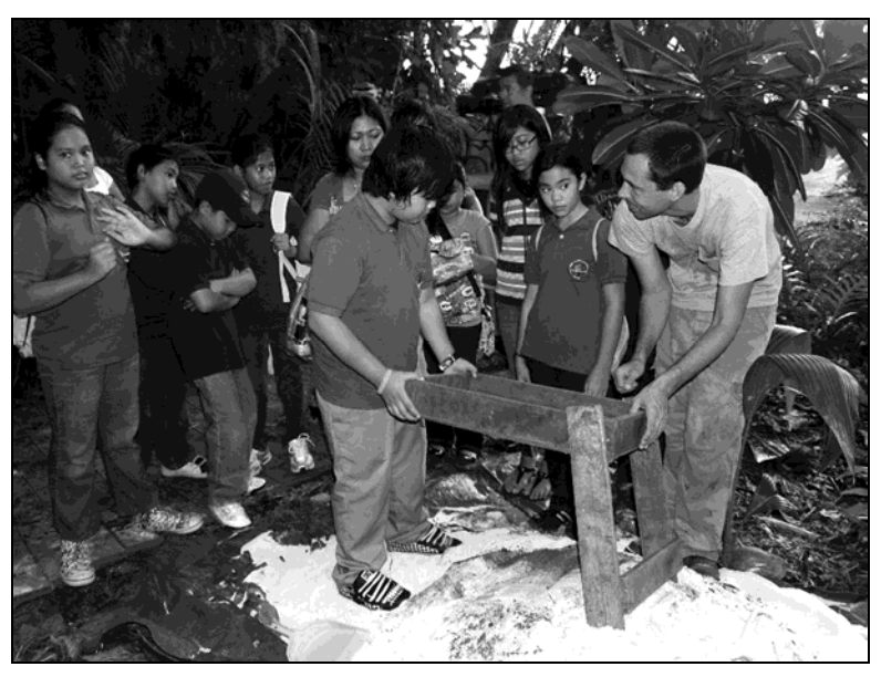
Figure 8. Public participation in archaeology, Guam school children learning basic tasks of excavation at Ritidian, 2009.