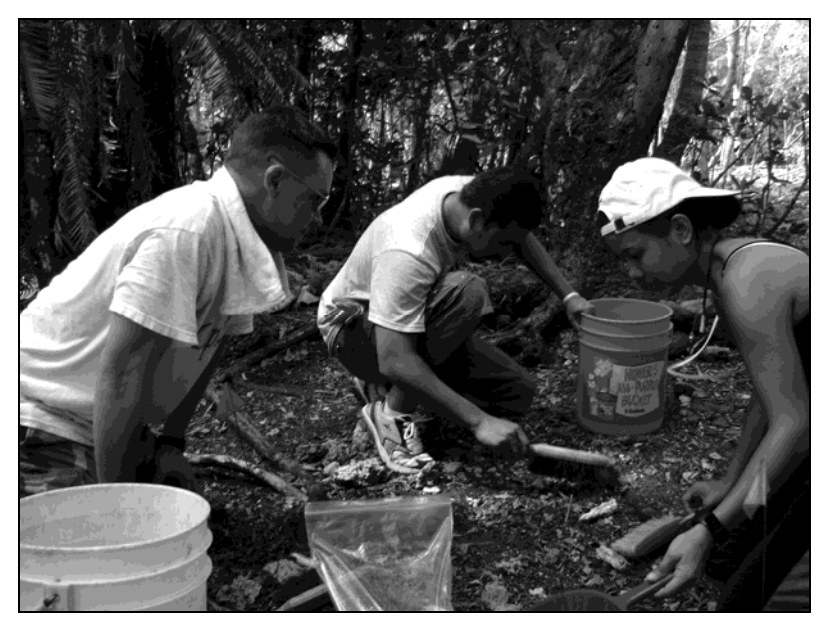
Figure 1. University of Guam archaeology field school students, practicing excavation techniques at Ritidian, 2010.